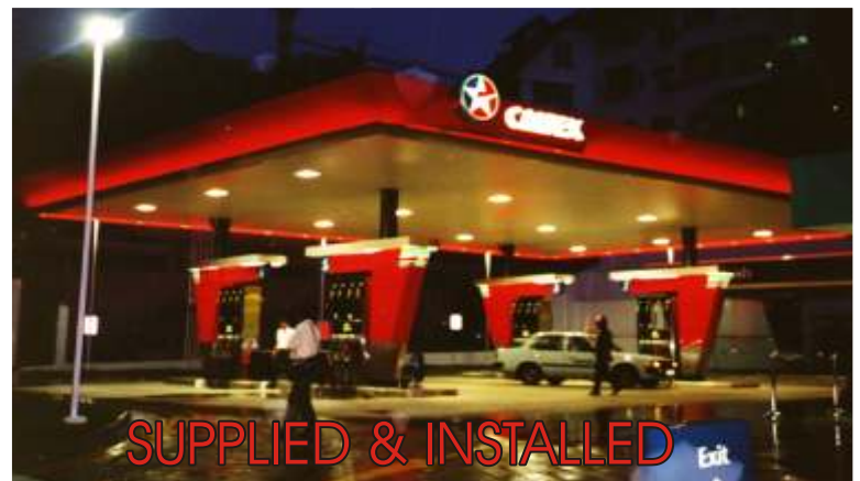
SUPPLIED & INSTALLED

Contact the company with over 200,000 square metres of ACM experience.